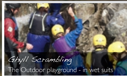
Ghyll Scrambling The Outdoor playground - in wet suits