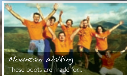
Mountain Walking These boots are made for...